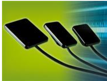
Fig. 1 Corded Digital Radiograph film 15

These systems work because the pixels are sensitive to x-ray photons and to light photons and this makes it possible to add a layer of luminescent crystals on top of the pixels which produce light when hit by x-ray photons. The sensor is connected to the computer by a cable and the electronic information produced by the pixels is transferred through the cable to the computer. 14